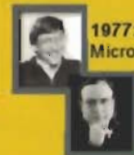
1977: Bill Gates and Paul Allen found Microsoft which was to create history