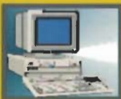
1981: IBM PC launched by IBM with DOS from Microsoft.

IT Project and Business Management + Leadership Through Enlightenment + Joyful Campus Life Over 4 Terms